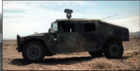
VEHICLE MOUNTED CAM\IR 2400

Thermal imaging systems are passive and non-intrusive, detecting day or night, in most weather, and over distances. As a result, they are invisible to intruders, allowing security personnel to monitor their actions without their knowledge, protecting people and assets before they are exposed to danger.